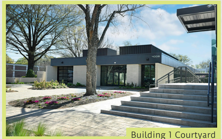
Building 1 Courtyard