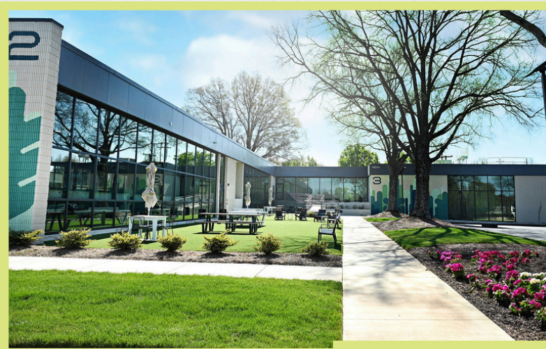
Building 2 Courtyard