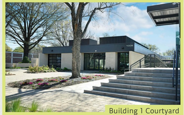
Building 1 Courtyard