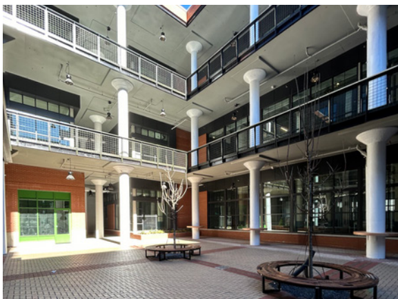
THE THREAD | ROCK HILL, SC