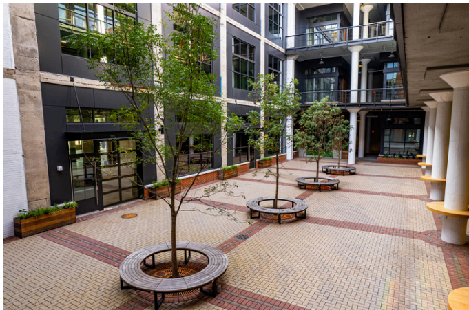
THE THREAD | ROCK HILL, SC