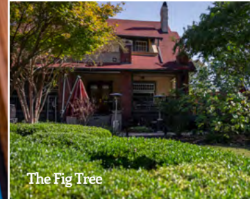
The Fig Tree