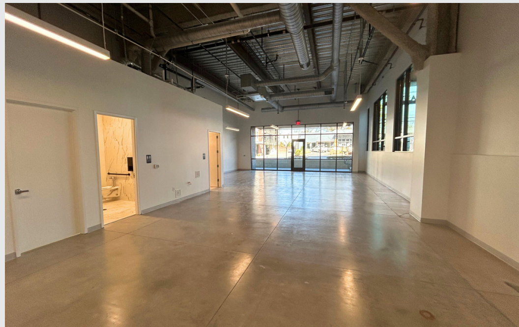
VANILLA BOX - SUITE D - 1,990 RSF