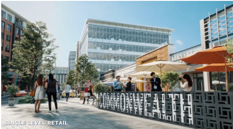
SINGLE LEVEL RETAIL