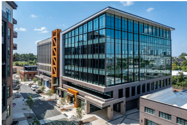
1401 CENTRAL AVE. | CHARLOTTE, NC